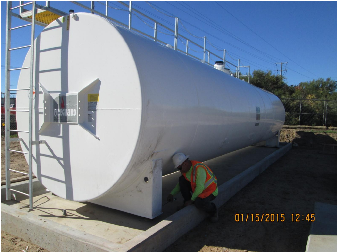
Diesel fuel tank for one of the existing generators at Sewer Pump Station No.1

The design-build delivery method is being used for this project. Construction began in July 2014 and is anticipated to be completed by December 2015. The estimated total project cost is $17.75 million.