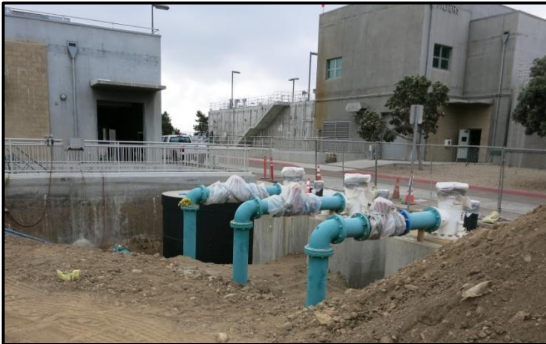
New feed water piping and concrete bases for vertical turbine pumps

The design-build delivery method is being used for this project. Construction began in December 2014 and is estimated to be completed in early 2016. The estimated total project cost is $5.97 million.