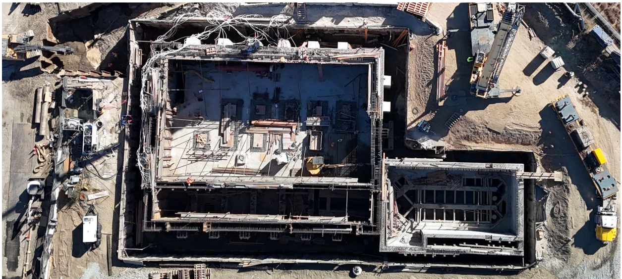
Morena Pump Station and Screening Facilities – January 25, 2025