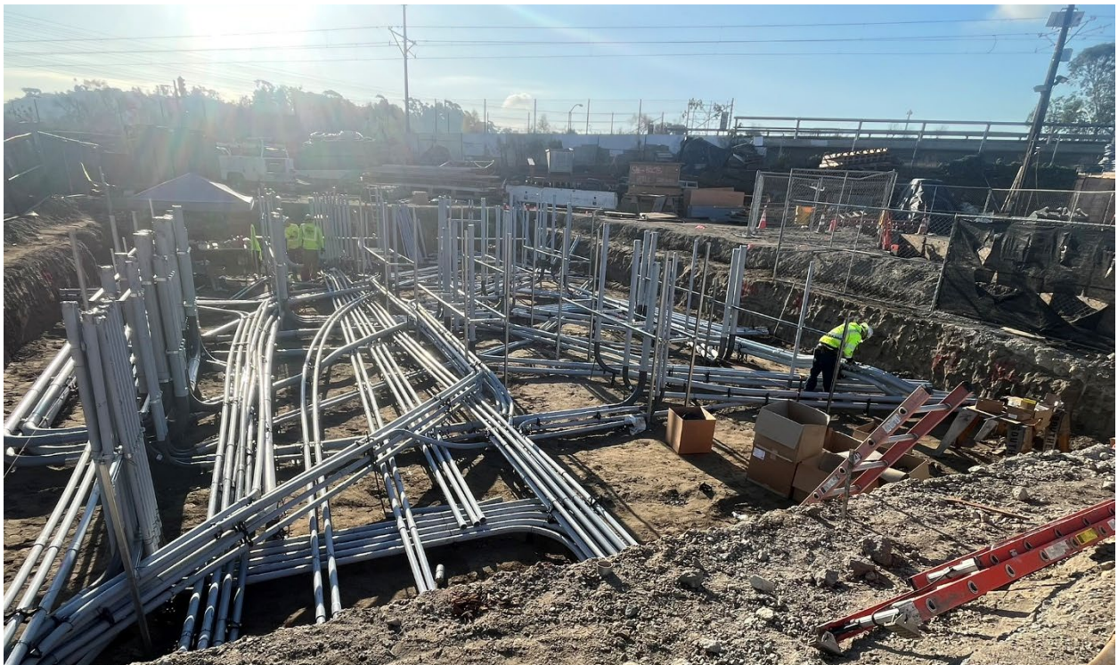
Morena Pump Station Electrical Building Conduit Placement – January 2025