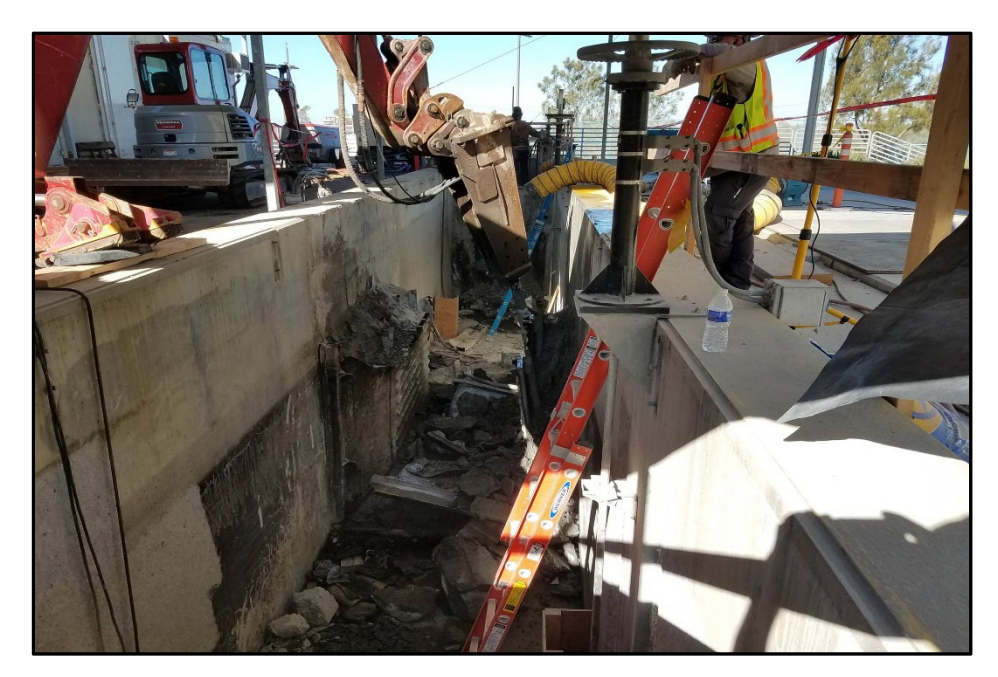
Left Photo: Demolition of the existing UV channel

The project will replace the existing ultraviolet (UV) disinfection system inside the South Bay Water Reclamation Plant with a more advanced model in order to increase energy efficiency, reduce O&M costs, and system operation.